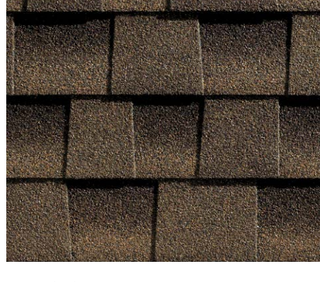
LayerLock<sup>™</sup> Technology Powers the industry's widest nailing zone